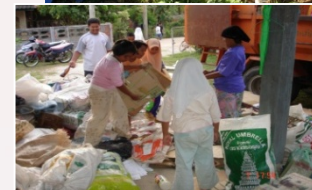
G13 Climate Change Action