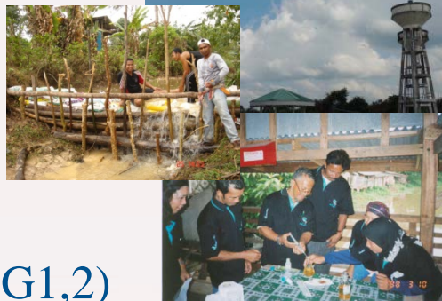
G6 Clean Water & Sanitation