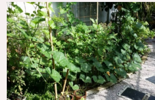
G7 Clean Energy