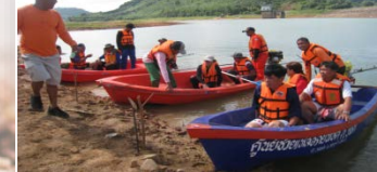
G17 Partnership for the Goals